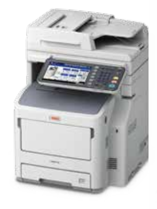
MB770 - Up to 55 ppm; 630-sheet standard paper capacity, upgradable to 3,160 sheets; 20-sheet convenience stapler