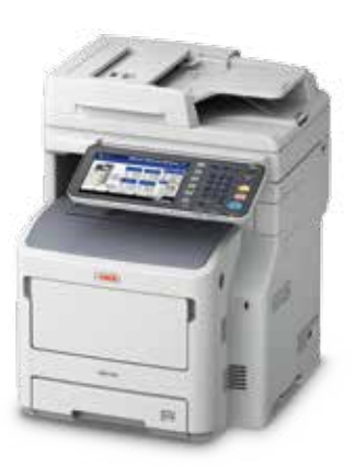
MB760 - Up to 49 ppm; 630-sheet standard paper capacity, upgradable to 3,160 sheets

And, as new applications become valuable to your business, they can be added to your MFP's feature sets using embedded OKI smart Extendable Platform technology.